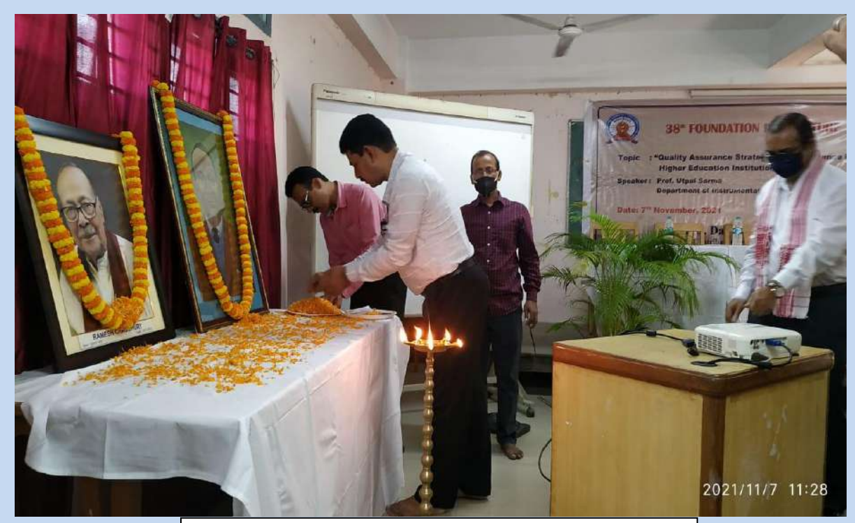
CELEBRATION OF 38<sup>TH</sup> FOUNDATION DAY, 2021