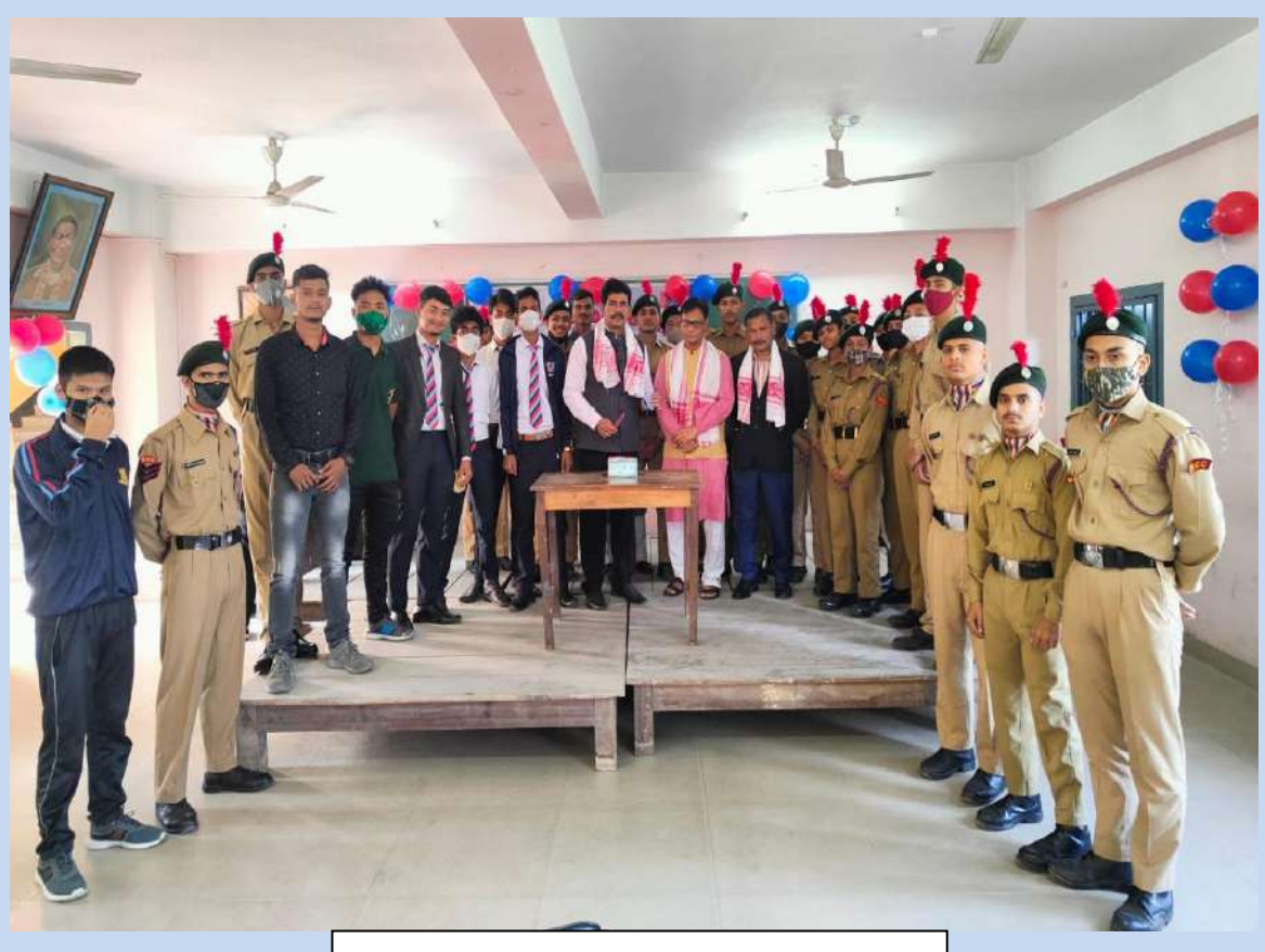
CELEBRATION OF NCC DAY, 2022