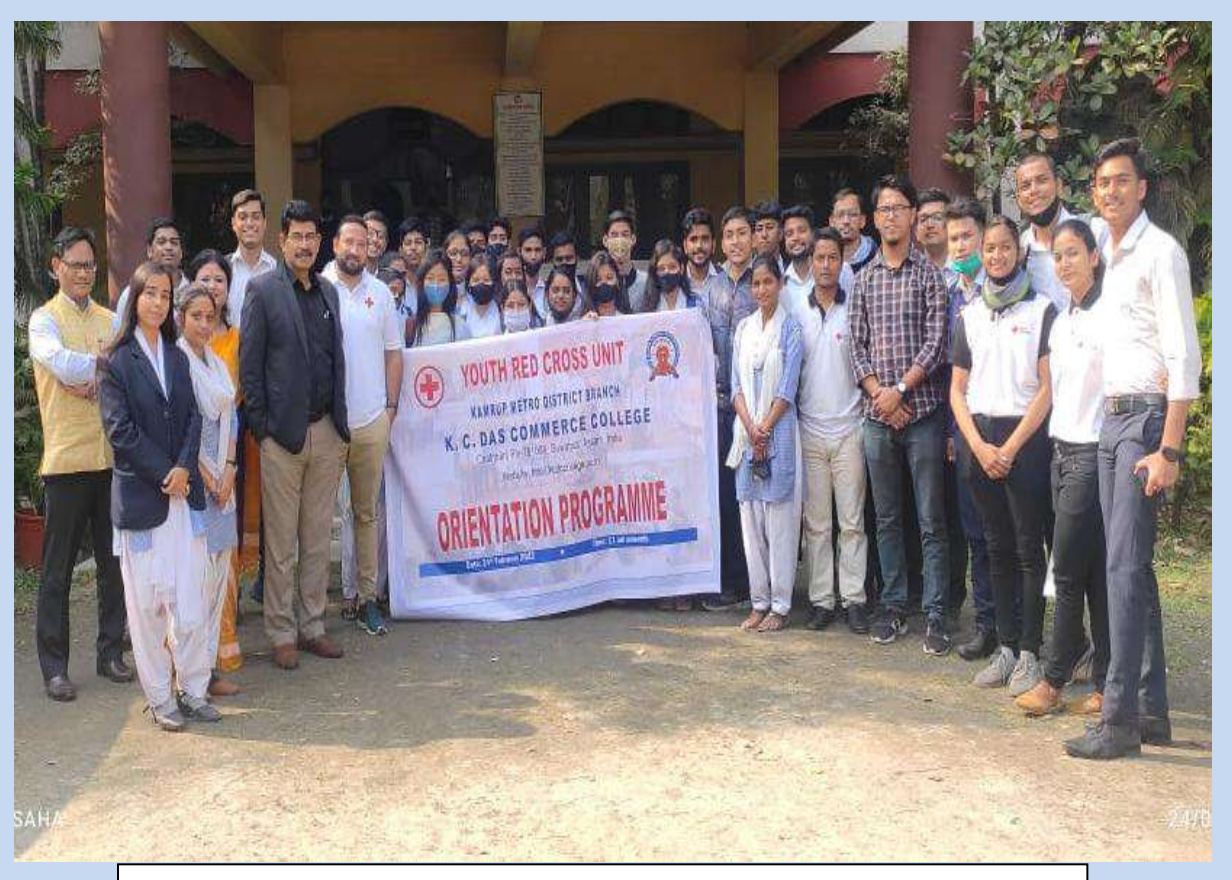
ORIENTATION PROGRAMME - KCDCC YOUTH RED CROSS UNIT