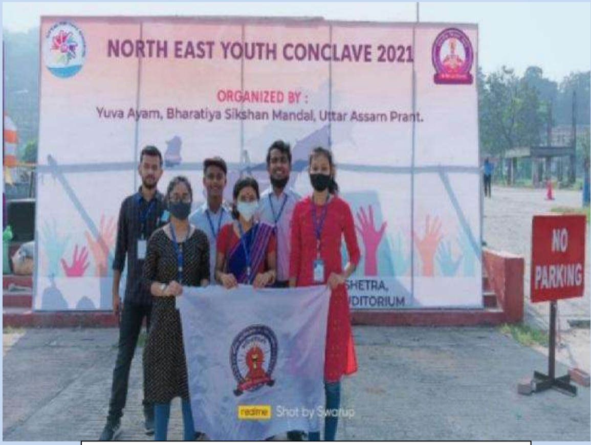
STUDENT PARTICIPATION IN NE YOUTH CONCLAVE, 2021