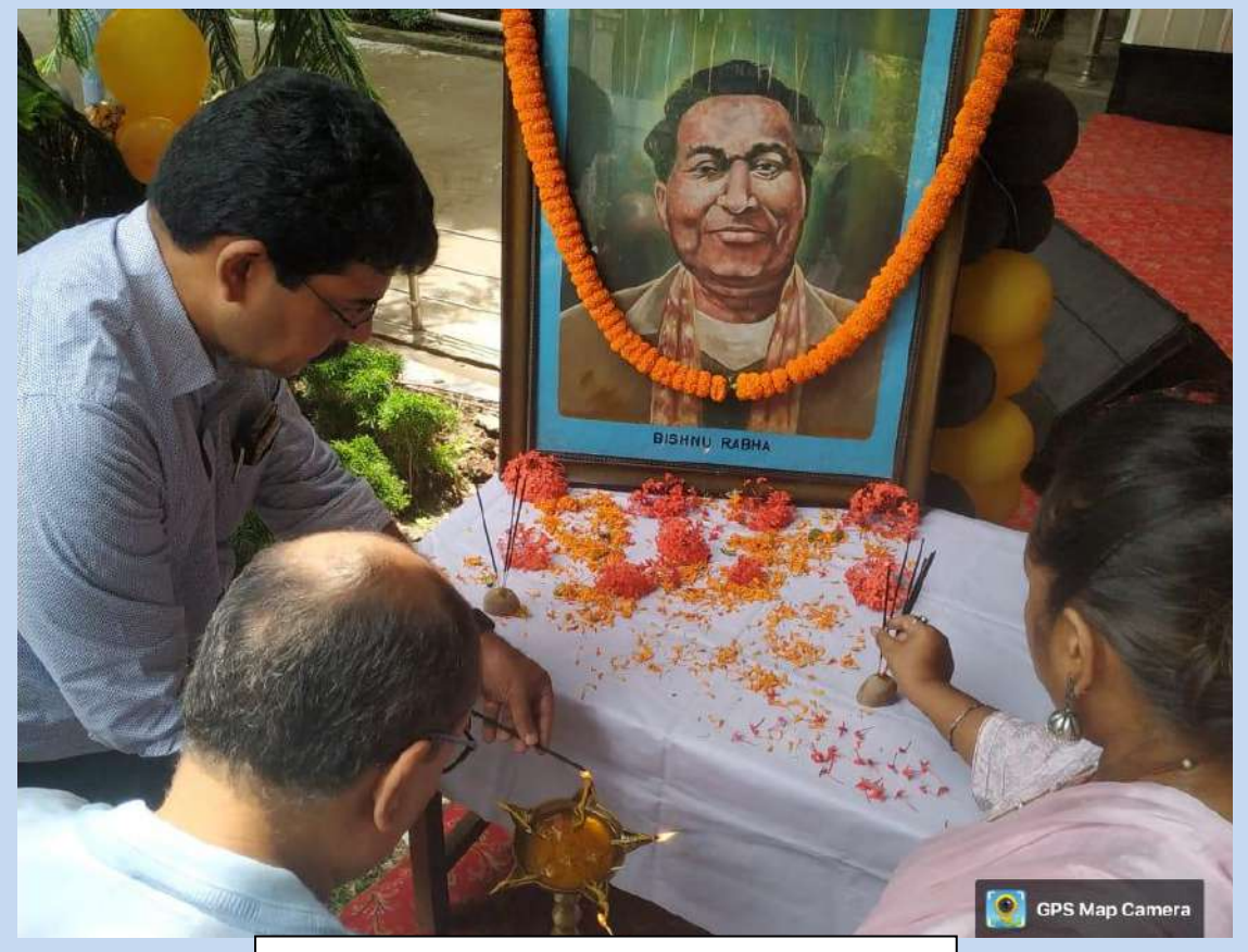
CELEBRATION OF BISHNU RABHA DIVAS, 2022