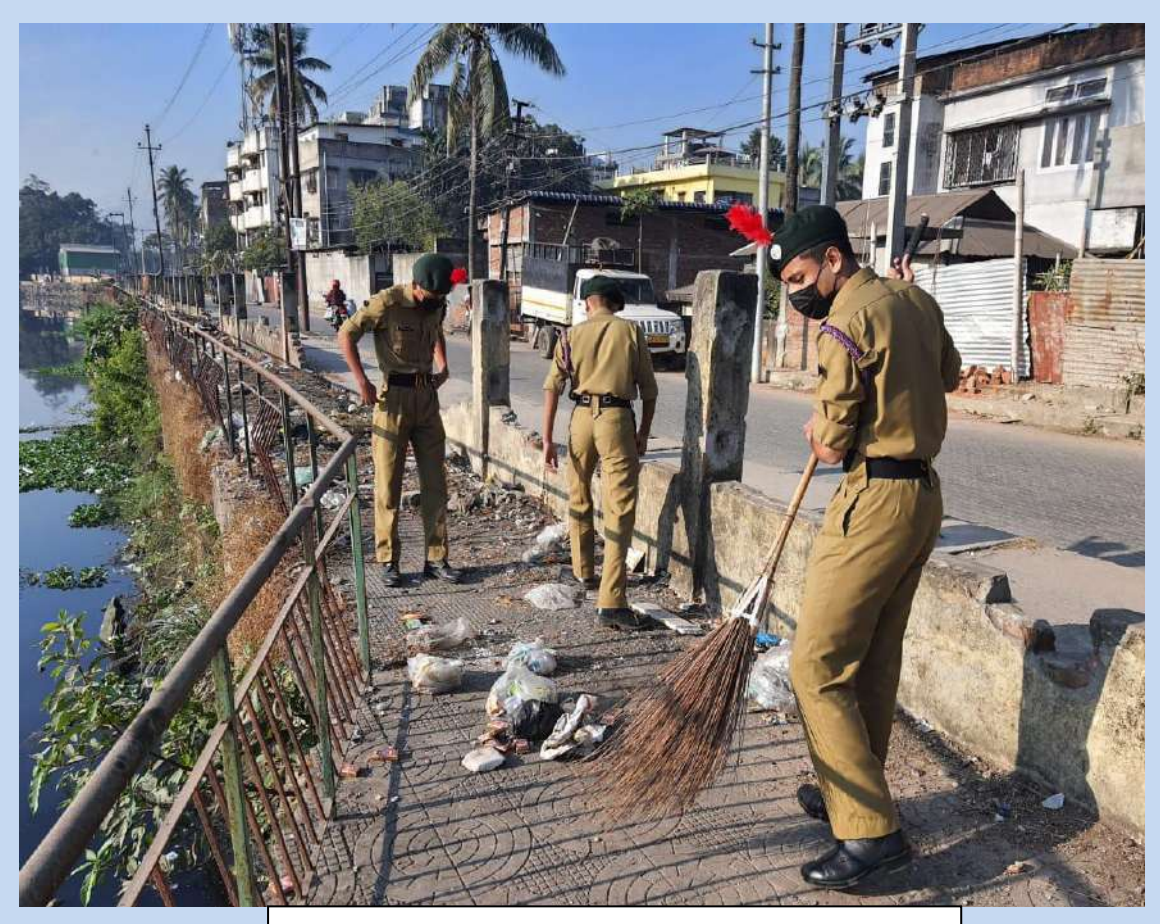
CLEANLINESS DRIVE BY OUR NCC CADETS