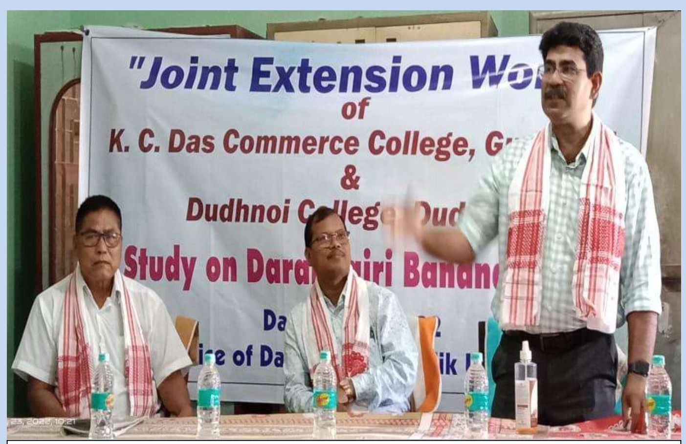
EXTENSION SURVEY WORK OF COMMUNITY RESEARCH AND DEVELPMENT CELL AT INDIA'S LARGEST BANANA MARKET, DARRANGIRI