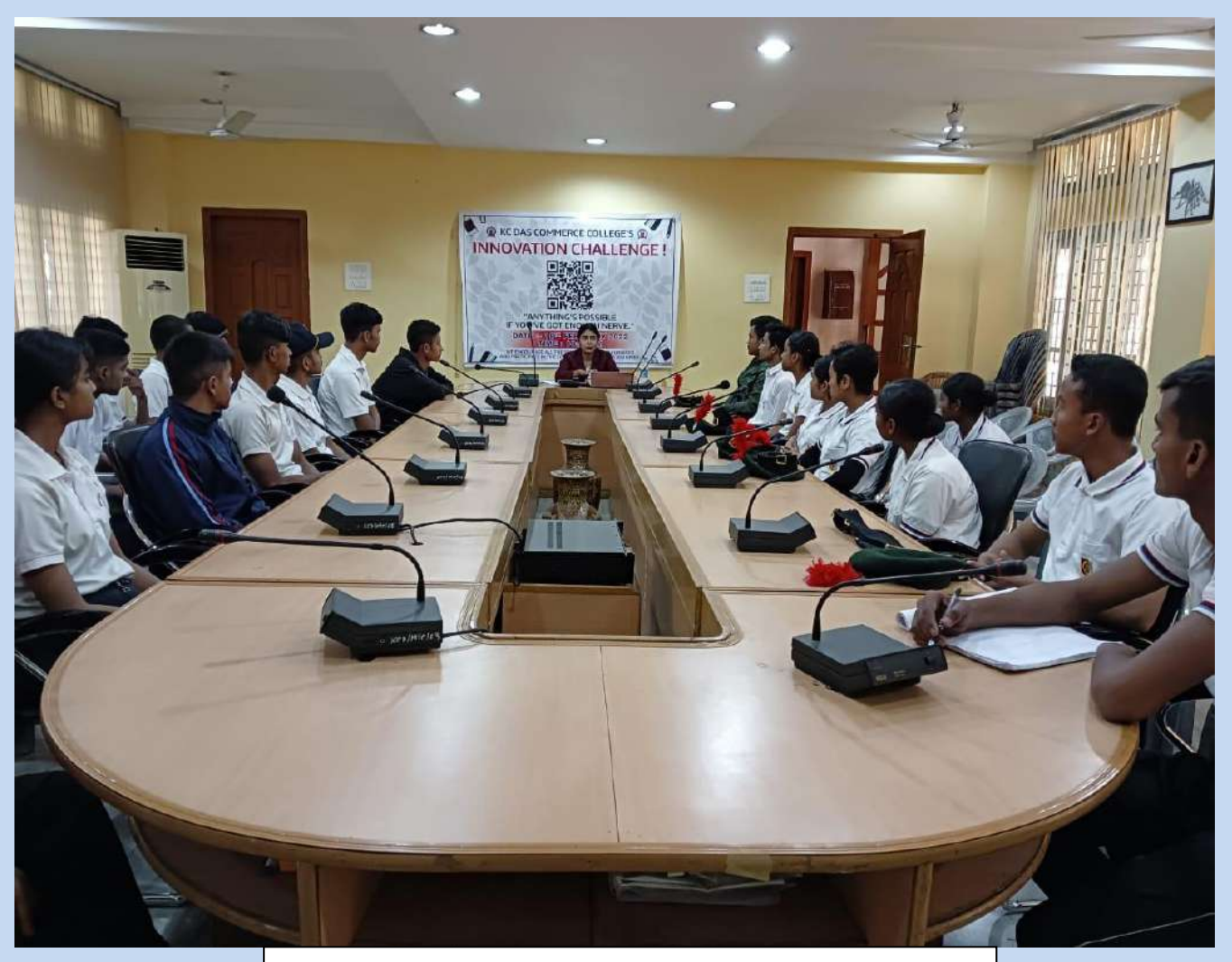
INSTITUTIONAL INNOVATION CHALLENGE, 2022