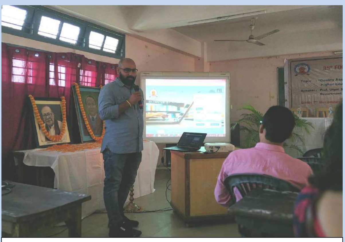
INAUGURATION OF IN-HOUSE LEARNING MANAGEMENT SOFTWARE DEVELOPED BY THE I.T. RnD CELL OF THE COLLEGE