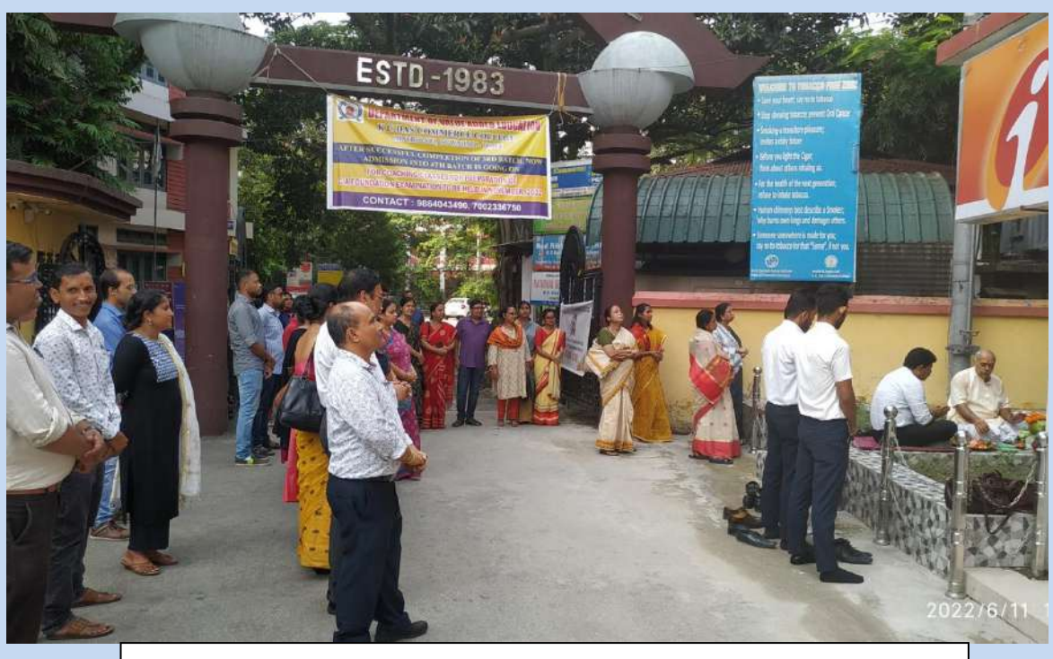
INSTALLATION OF SARASWATI IDOL IN THE COLLEGE CAMPUS